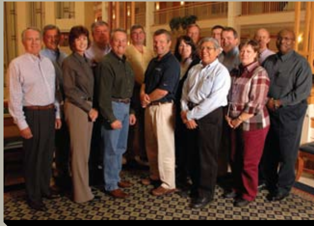
The 2008 ASI Primary Insured Credit Union Advisory Council.

The 2008 edition of the ASI Primary Insured Credit Union Advisory Council ("Council") convened for its annual meeting on September 30 in Dublin, Ohio. The Council is comprised of CEOs from ASI primary insured member credit unions, and meets annually to review the performance of the insurance fund and to discuss topics relevant to ASI and its insured credit unions.